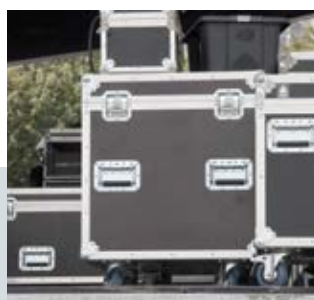
Events and stage construction