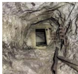
Structural steelwork and mining