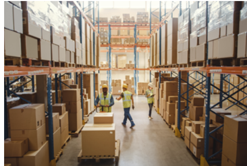
Building infrastructure and trailers