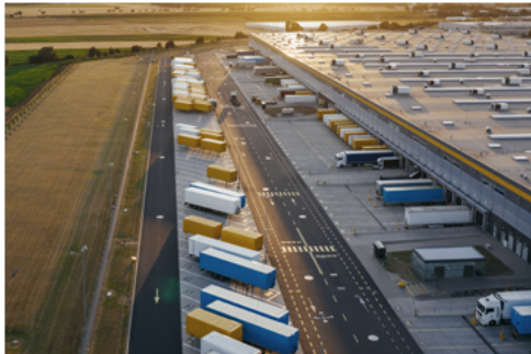
Power supply for logistics centers