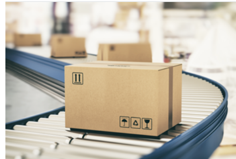
Power supply of systems technology