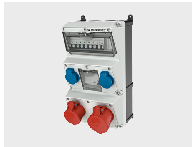
PORTFOLIO RECEPTACLE COMBINATIONS

Our individually equipable AMAXX receptacle combinations and other wall-mounted power distributors for use within the systems can be found here: