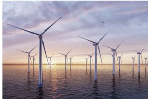
Wind turbine operation