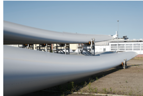
Production of wind turbines