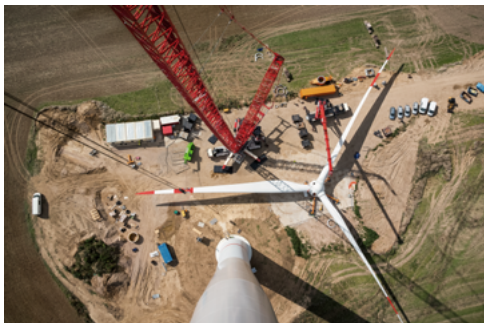
Assembly of wind turbines