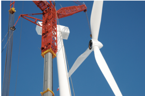
Power supply for wind turbines