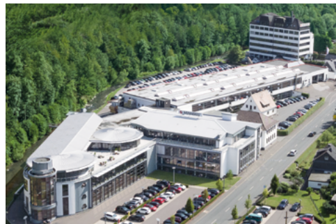
We are MENNEKES