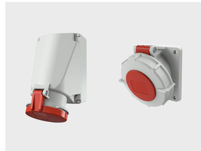
PORTFOLIO PLUGS AND SOCKETS

We offer various wall and surface-mounted receptacles for power distribution in the tower and nacelle of wind turbines. You can find the right product solutions here on the corresponding portfolio: